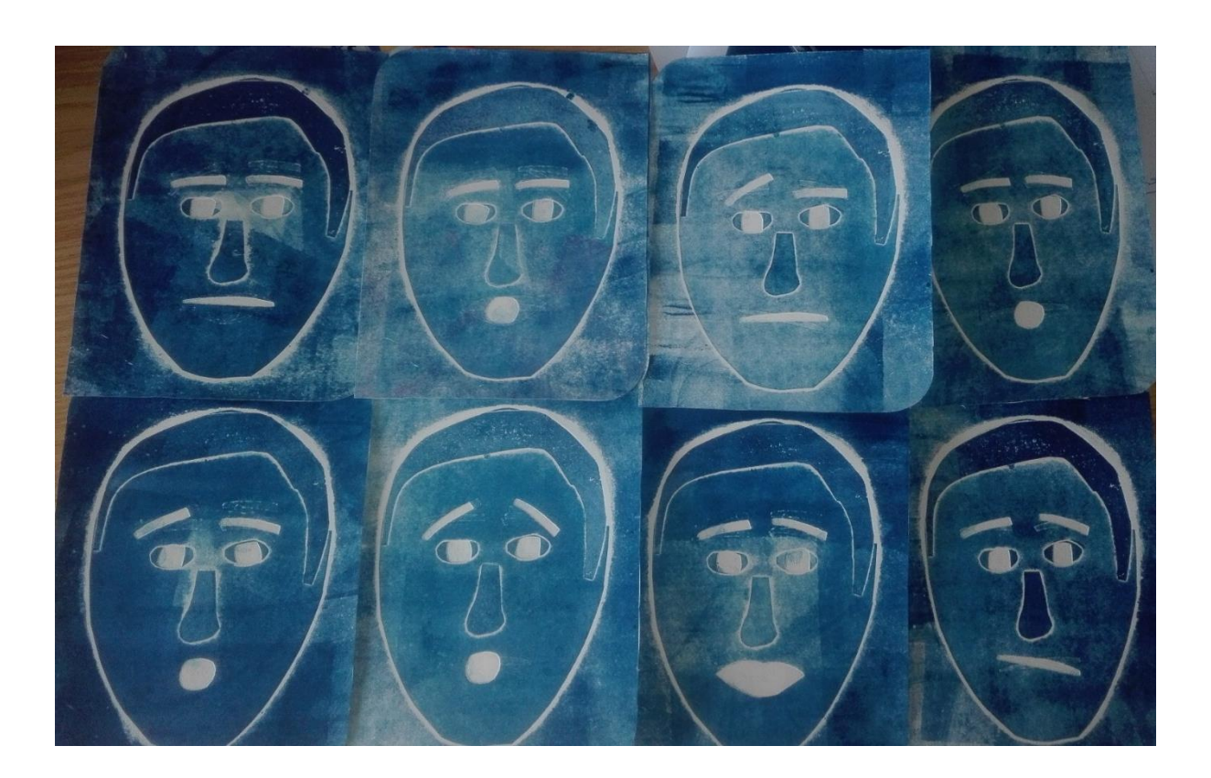
Figure 2 – A print produced by one participant. The diary caption underneath read "Scientist? Networker? Coordinator? Communicator". This example is illustrative of the ways in which some participants used different art forms to reflect on their professional roles (JA).

Overall, these narratives illustrate the significant impact that this art-science collaboration had on the ways in which individual participants viewed their standard practices to science communication. As such, the extracts demonstrate not only a recognition of the ineffective nature of deficit communication,