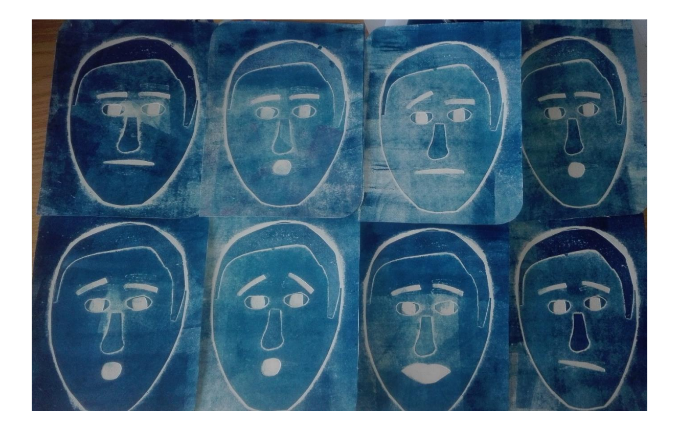
Figure 2 – A print produced by one participant. The diary caption underneath read "Scientist? Networker? Coordinator? Communicator". This example is illustrative of the ways in which some participants used different art forms to reflect on their professional roles (JA).

"I found that it (the workshops) really helped me to change my perspective, and have a much clearer message, to try and simplify and make it more striking, personal, relevant to people, rather than facts, numbers and evidence. So that will definitely stay with me and I've been thinking about how to include that in my science communications much more" (PB).