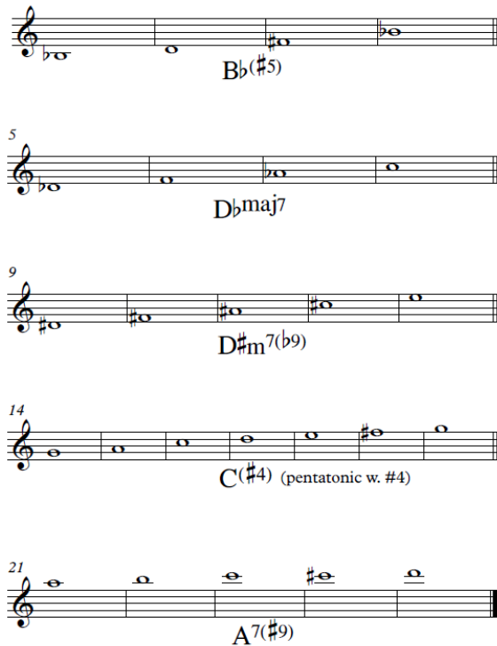
215 Figure 4: Score of the Selinunte composition.

The interplay between the geophysicist, which sonified the data, and the musicians is certainly one of the main step since it represents an effective connection between Music and Geology: besides the pitches extracted from the subsurface, the geophysicist/geologist provides some keywords that can suggest ideas for the improvisation/composition by the musicians.