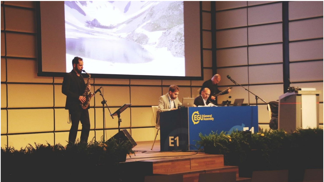
Figure 5: A moment of the “Sounds from the Geology of Italy” show at EGU2018.

255 The EMusic project and its ongoing activity in collaboration with INGV has been presented in several occasions at the EGU General Assembly. The General Assembly is the annual venue of EGU, the greatest in Europe gathering geoscientists from all over the world. The Assembly includes also outreach sessions, and since 2015 also a session on Earth sciences and Art. So, we arranged the presentations in order to capture the attention of a wide public.