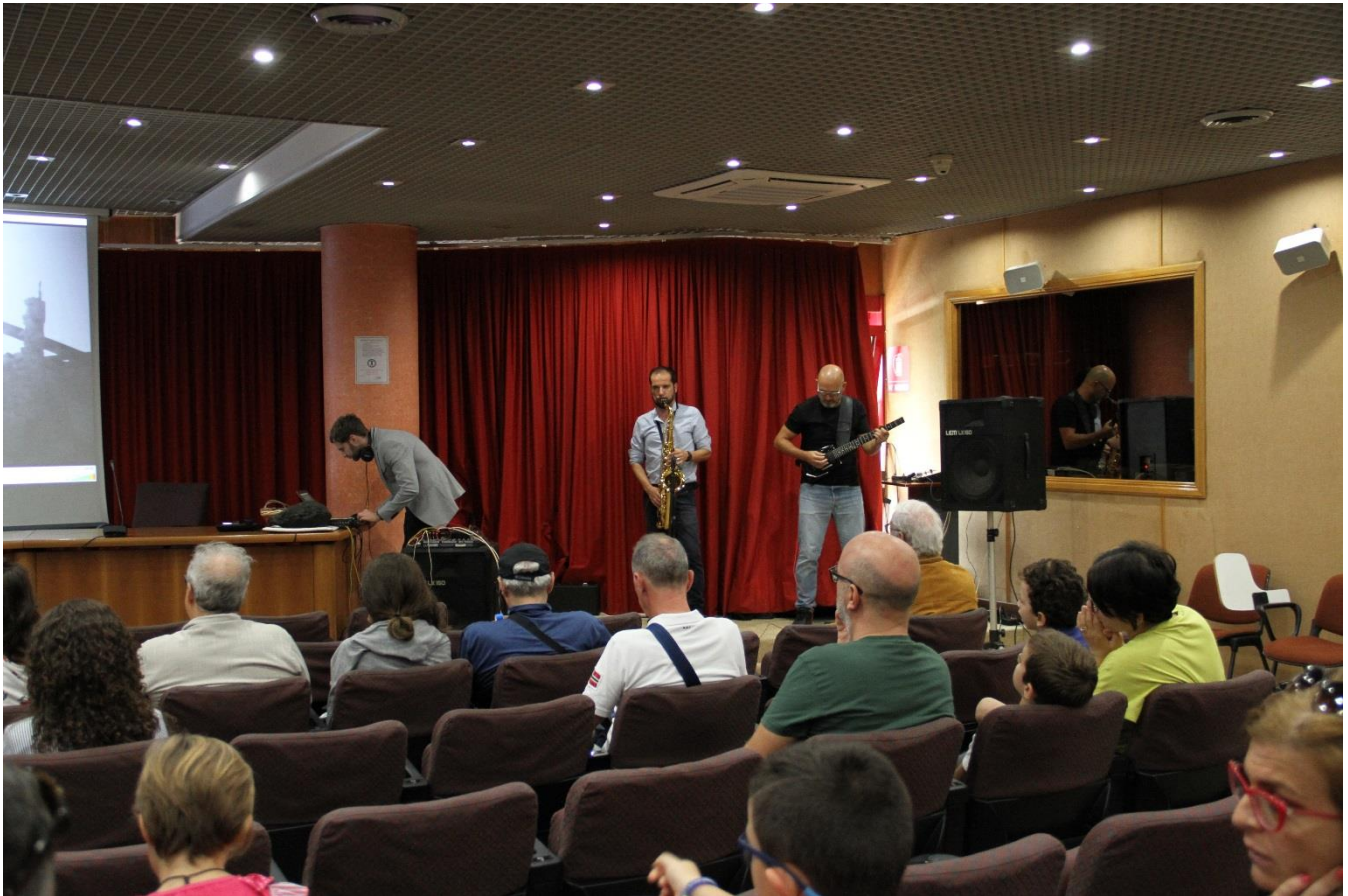
Figure 7: INGV Open Day in Rome.