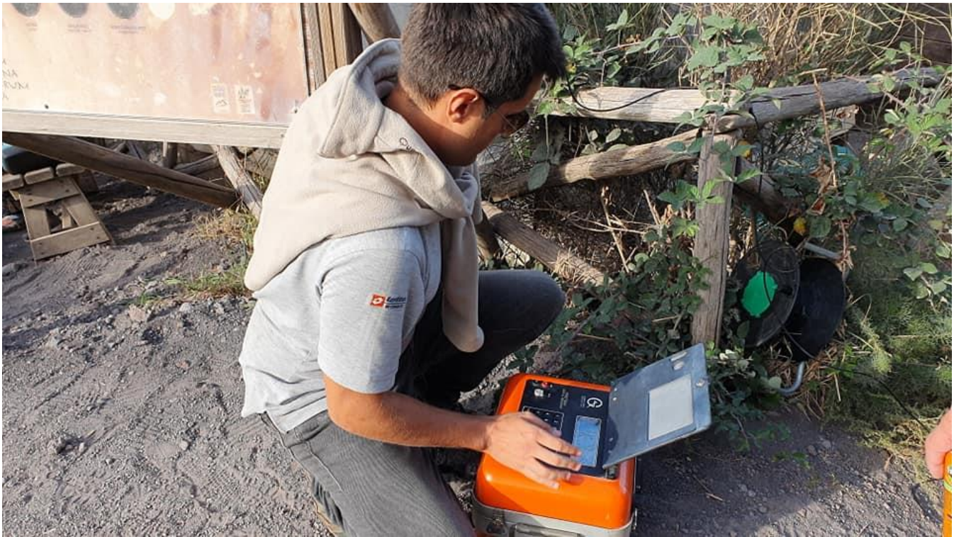
Figure 6: TEM data acquisition at the top of Vesuvius Volcano.