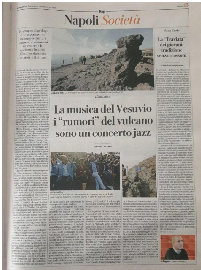
Figure 8: A full page of La Repubblica newspaper dedicated to the Concerto Vesuviano.