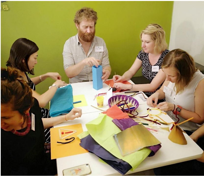
Figure 3. Creative networking in action with participants from mixed disciplinary backgrounds exploring what risk communication meant to them.