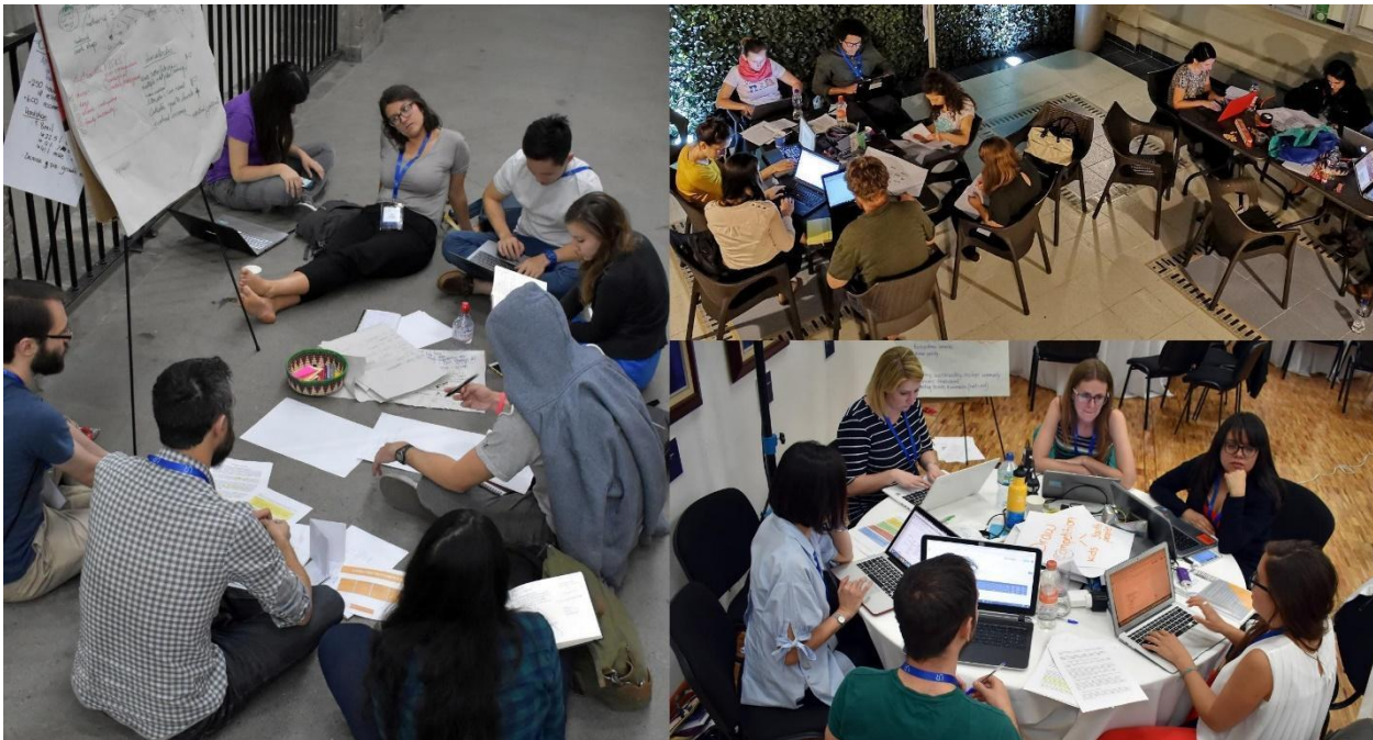
Figure 4. Teams in action throughout the day and night in a range of working environments.