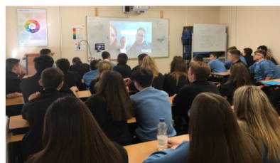
Kingswood Community College, Dublin