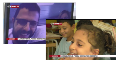
I.C. Don Milani Lamezia Terme, Italy