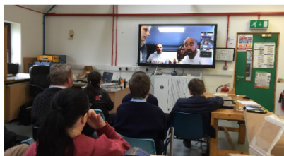
Coláiste Phobail Cholmcille Tory Island, Co. Donegal