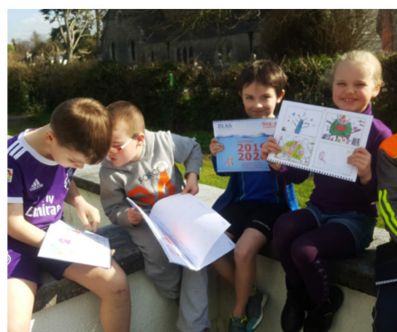
Figure 4: Participants of the Primary School Drawing Competition with their prizes, calendars featuring their art. Top left: the 2019-2020 calendar. Top right: students at Istituto Comprensivo Don Lorenzo Milani, Lamezia Terme, Italy. Bottom, left and right: students at Abbyleix South National School, Abbyleix, Co. Laois, Ireland.