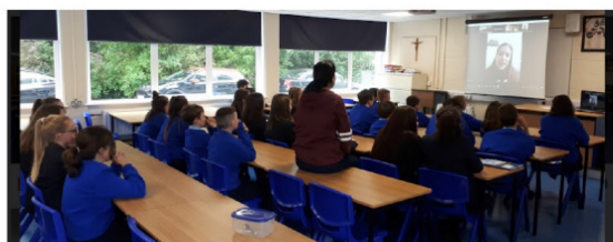
Scoil Mhuire, Buncrana, Co. Donegal