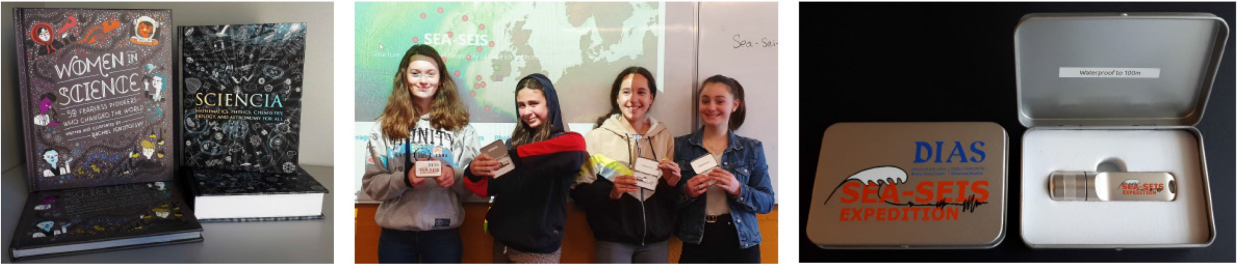
Figure 5: Prizes and some of the winners of the geoscience song-and-rap competition for secondary schools. Left: 650 Inspirational science books went to classes with winning and runner-up groups. Centre: one of the two Grand Prize winning groups (Lycée Français d'Irlande, Dublin). Right: SEA-SEIS branded, 16GB flash drives were awarded to every student in the winning groups and to their teachers.