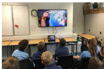
Gaelcholáiste Charraig Uí Leighin, Co. Cork