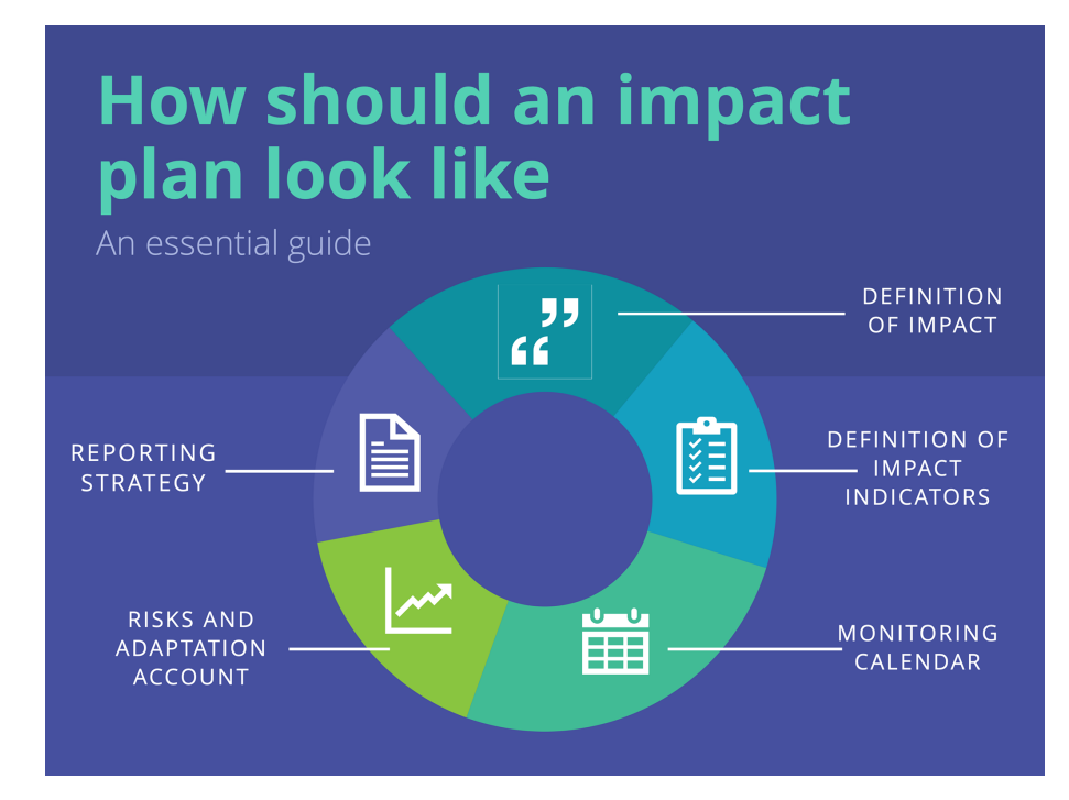
Figure 5. Graphic illustrating the five essential elements of an impact assessment plan.

partners in tracking and evaluating KT activities has been fundamental. Particularly with respect to scientific publications and conference proceedings, the active participation of each scientist in maintaining the internal tracking instruments such as the project's Zenodo archive and the table of dissemination and outreach activities allowed for a comprehensive and exhaustive assessment of the project's dissemination reach. Involving each project partner in all stages of the development of an impact plan is key to elaborating a strategic plan truly tailored to the needs and the capacities of a project.