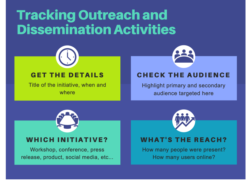
Figure 2. Schematic summary of the most relevant aspects to track and evaluate the performance of outreach and dissemination activities.

The main objective of this database is to have a comprehensive overview of the places and audiences reached by AP-PLICATE initiatives to be able to assess the scope of these efforts on the one hand and to evaluate the pertinence with the communication strategy and its objectives on the other. The latest point would include an evaluation of the target audience, i.e., if the events organized or attended reached out to the intended target group and if there are groups that these initiative fail to engage, thereby opening the path towards a correction of the strategy and the development of an ameliorated plan.