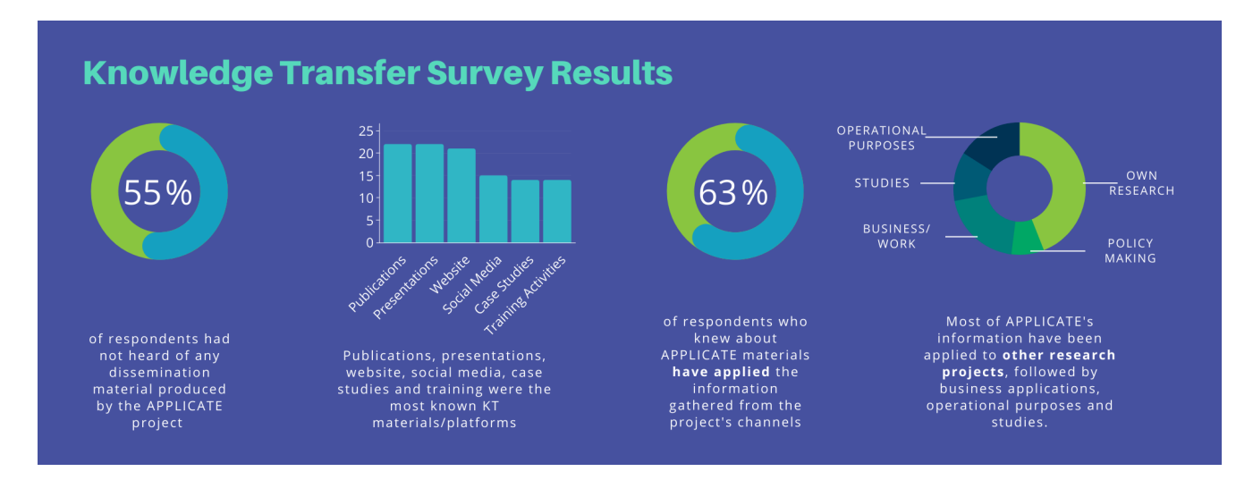
Figure 4. Summary of the main results of the APPLICATE's survey on knowledge transfer activities.