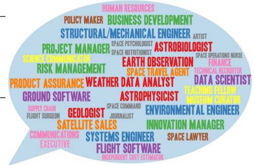
Figure 1. (a) Breakdown of current UK space sector careers resources compared to the UK Space Census 2020 (Thiemann and Dudley, 2021). (b) Outcomes of \chi^2 statistical tests from these distributions. (c) Word cloud of the space roles chosen for a new resource, where colours relate to the categories in panel (a) (font sizes have no meaning).

to the design of a new careers resource is beyond the scope of this paper.