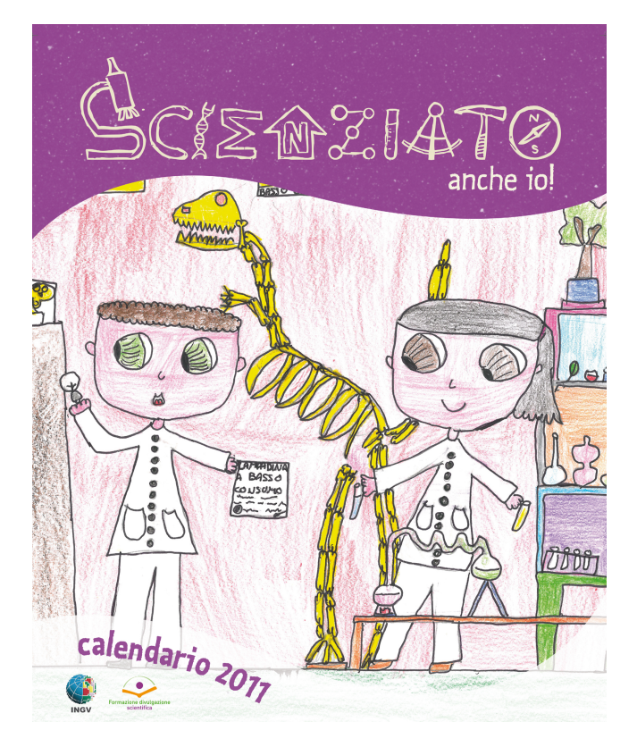
Figure 4. The design chosen for the 2011 calendar cover summarizes the main themes presented in the drawings sent by the children. Smiling scientists, confident of the potential of science, engaged in enthusiastic discoveries to improve life on the planet (edited by INGV Laboratorio Didattica e Divulgazione Scientifica and INGV Laboratorio Grafica e Immagini).