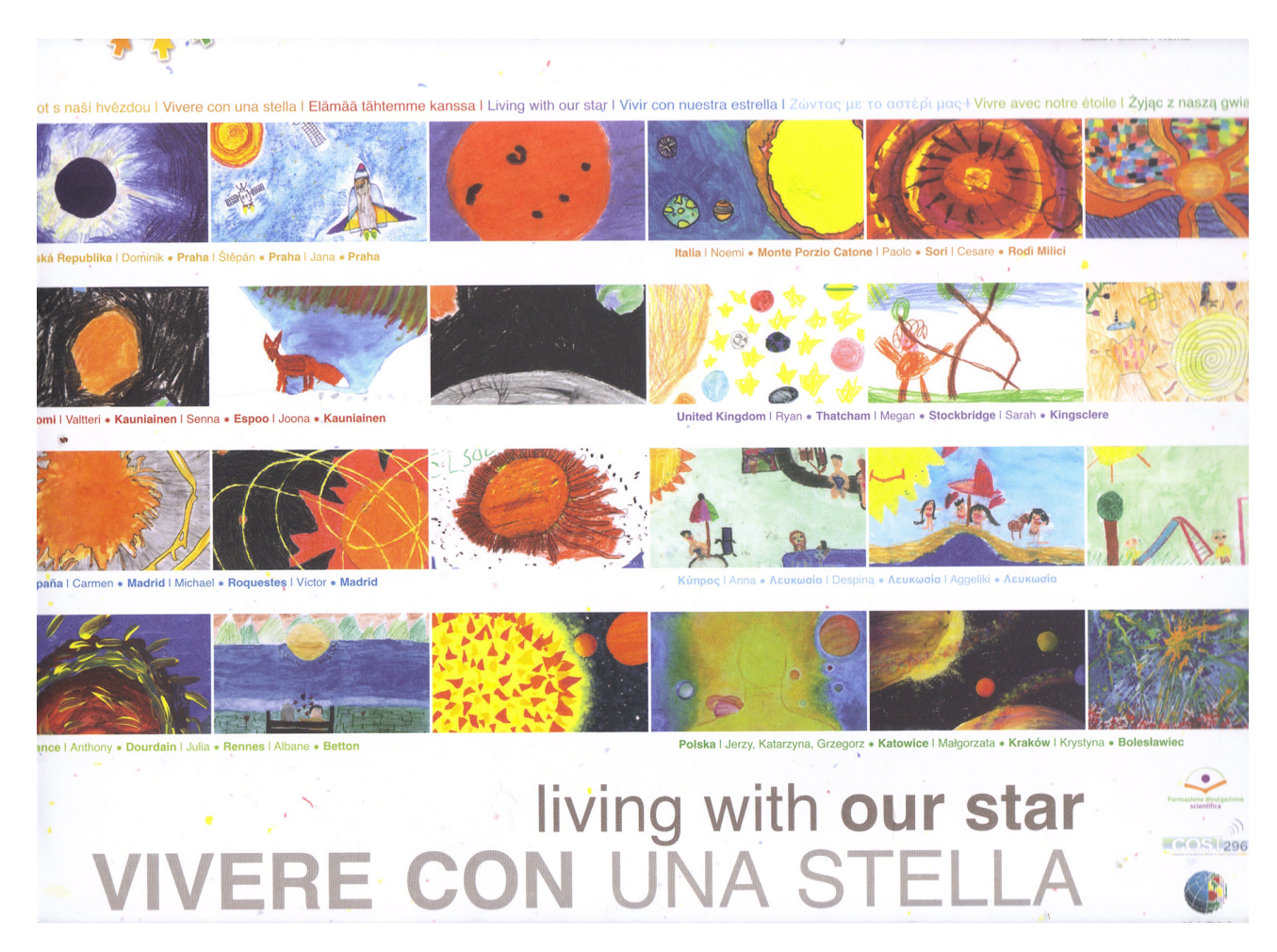
Figure 2. The back cover of the 2007–2008 calendar dedicated to the Sun and realized, through a partnership of European countries in the COST269 project, in eight languages (edited by INGV Settore Formazione e Divulgazione Scientifica and INGV Laboratorio Grafica e Immagini).