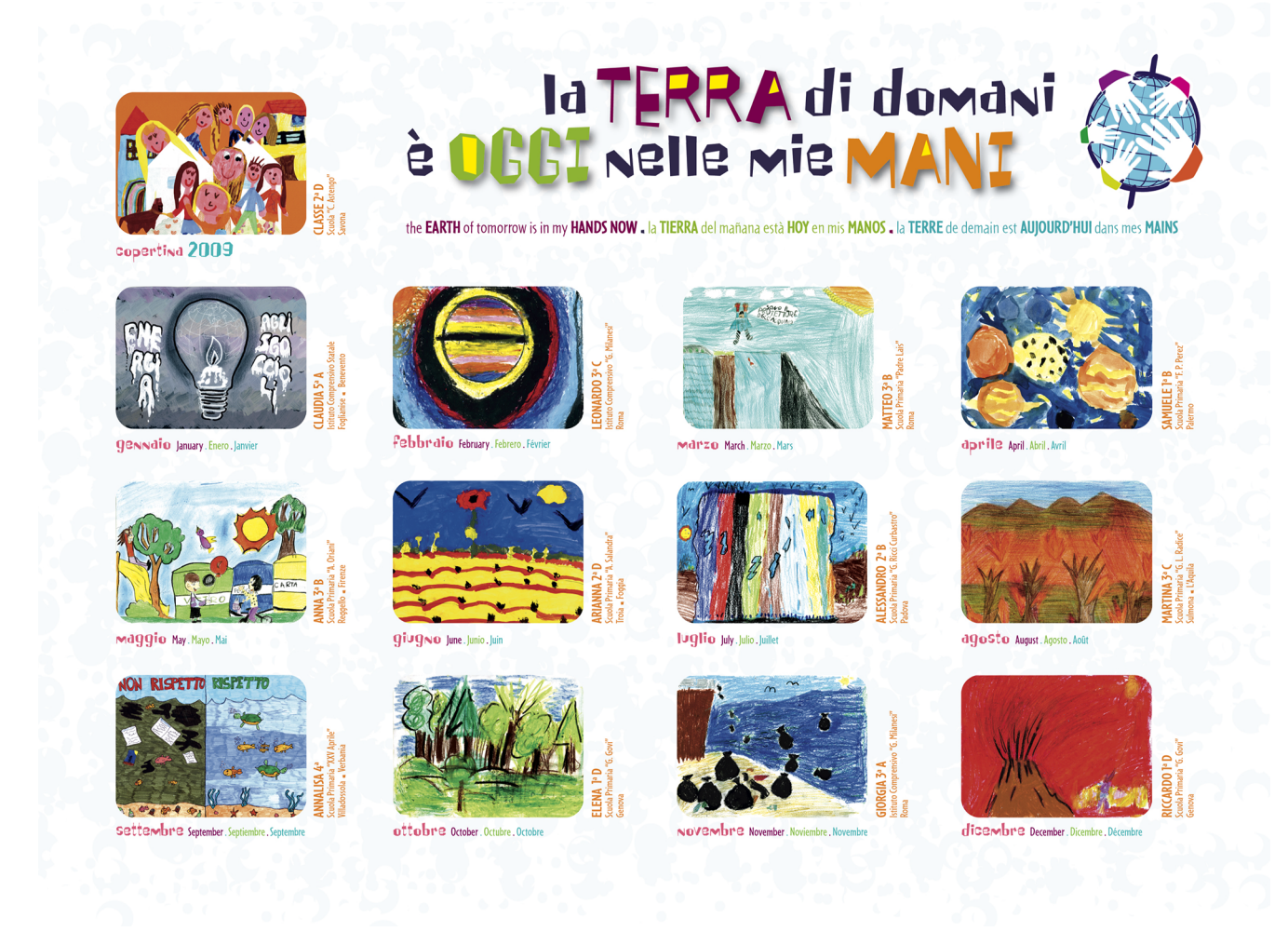
Figure 3. The back cover of the 2009 calendar dedicated to the Earth and to the present responsibility to protect the environment (edited by INGV Laboratorio Didattica e Divulgazione Scientifica and INGV Laboratorio Grafica e Immagini).

canoes and fields of flowers but also images showing concern for the environmental degradation and the indiscriminate use of the planet's resources. Disrespectful behaviour is sometimes represented as being fought by superheroes or protectors. Moreover, drawings of the natural environment and everyday life highlight virtuous and environmentally friendly behaviour, respect for the environment and the importance of taking care of it (Fig. 3).