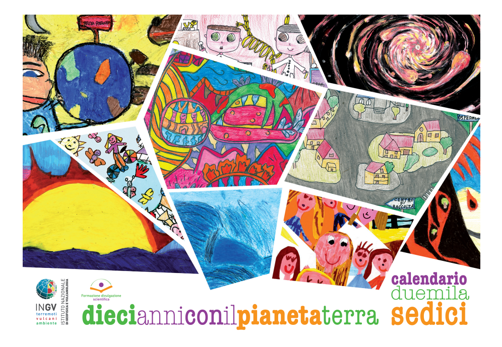
Figure 1. The cover page of the 2016 calendar made with a collage of all previous calendar covers (edited by INGV Laboratorio Didattica e Divulgazione Scientifica and INGV Laboratorio Grafica e Immagini).

Rome. This event was strongly felt in the town of Subiaco (RM), shocking teachers and students of a local primary school. This lead to the idea of developing a dissemination project focused on earthquakes. Children, who have been taught about earthquakes, can be engaged to use their artistic expression and demonstrate their awareness of this phenomenon through drawings (Izadkhah and Gibbs, 2015). The aim of the project was for the children to learn about the causes of earthquakes and to become familiar with a phenomenon often considered random and unpredictable. Moreover, an important aim of the project was to train students and teachers to behave properly during the occurrence of an earthquake. At the end of the project, the researcher team realized a calendar that displays earthquakes using the children's original drawings and texts, presenting their own impressions and experiences of earthquakes and shaking effects. According to the researchers' efforts, most students have focused on what they have learned about the simple behaviours that can help reduce damage.