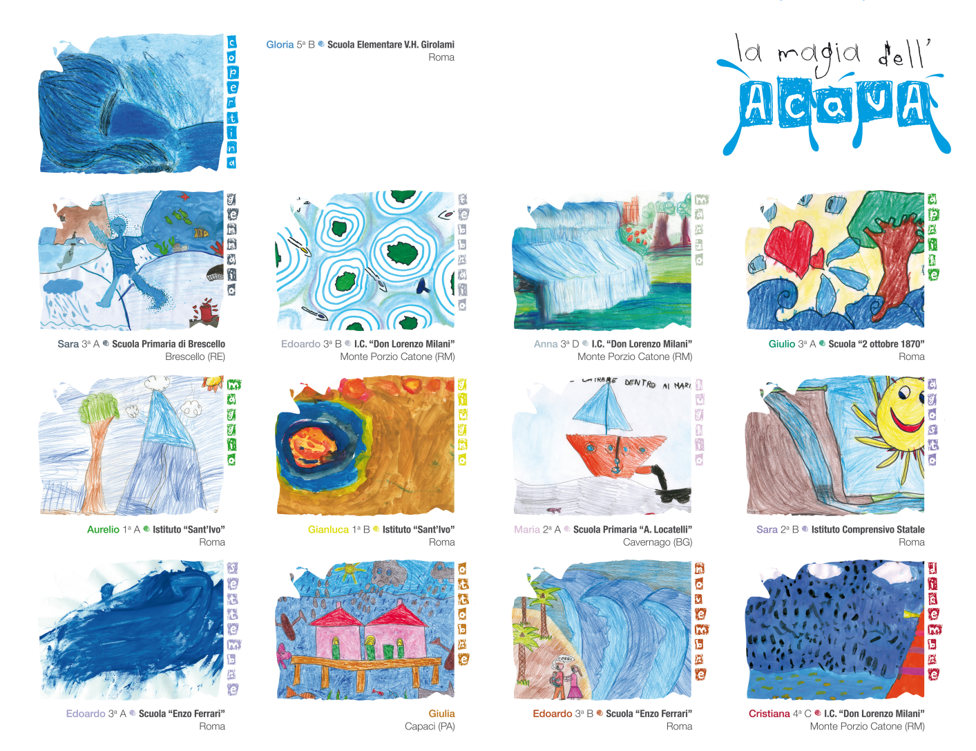
Figure 6. The back page of the 2014 calendar dedicated to water (edited by INGV Laboratorio Didattica e Divulgazione Scientifica and INGV Laboratorio Grafica e Immagini).

vey the scientific messages to teachers and students. Moreover, a direct interaction, even if at distance, can offer the possibility of feedback on the efficiency of the initiative in raising knowledge and awareness.