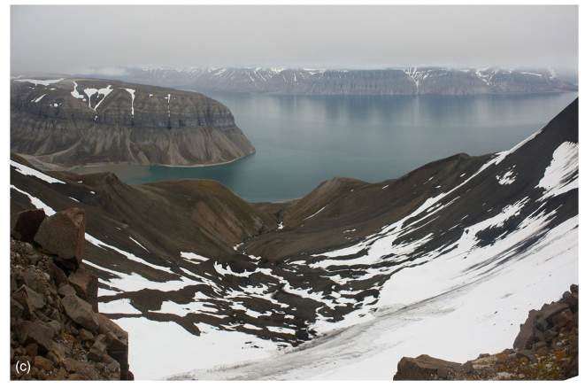
Figure 9. Svalbard landscapes. (a) Hornsund fjord, Spitsbergen, during the RV G.O. Sars expedition 191 under the "Present and past flow regime on contourite drifts west of Spitsbergen Area" (PRE-PARED) Eurofleets 2 project. (b) Ice coverage of the Svalbard islands along the northwestern coast during the RV OGS-Explora expedition under the "Petroleum Assessment of the Arctic North Atlantic and adjacent marine areas" (PANORAMA) project. (c) Skanskbukta bay (on the left), Billefjorden (centre) with (front) Bünsow Land cliffs during the Poli Arctici Skanskbukta base camp field trip by the Northern Rangers group.

Cevedale (Ortler Alps) massifs (Italy), the Bernese Oberland Alps (Switzerland), and on the Whillans Ice Stream (western Antarctica). Many sites were inspected along the Alpine chain to find suitable sites for the application of such techniques. The retreating glaciers bared their surface structure and crevasses, creating fascinating graphic effects (examples from Mont Blanc; Fig. 11b, c).