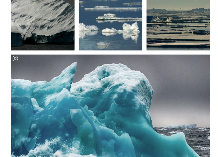
Figure 4. Icebergs in Antarctica. (a) Iceberg from XXI PNRA Antarctic expedition under the Western Antarctic Ice Sheet Evolution (WISE) project. (b, c) Sea ice view during shipping in the Ross Sea during the XXI PNRA Antarctic expedition under the WISE project. (d) Floating blue iceberg in the Ross Sea during the XXVIII PNRA expedition under the palaeomagnetism of sedimentary cores from the Ross Sea outer shelf and continental slope (PNRA-ROSSLOPE II) project.

eral days or months of on-board activity, often under harsh climatic conditions, rough seas, or being completely blinded by the thick fog or in the winter darkness, with the snow-covered land appearing like a mirage (Figs. 8a, c; 9a, b).