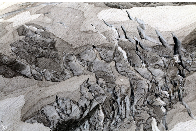
Figure 11. (a) A glacier on Mount Assiniboine, British Columbia, Canada seen during a field trip in the framework of the SEG 2009 Summer Research Workshop on "CO<sub>2</sub> Sequestration Geophysics". (b, c) A minor glacier in the Mont Blanc group (Italy) seen during a field trip in the frame of the "Near Surface Geoscience 2015 – 21st European Meeting of Environmental and Engineering Geophysics" project.