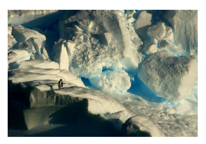
Figure 7. A lonely penguin on a drifting iceberg in the Ross Sea during the XXI PNRA Antarctic expedition under the WISE project.

phases of re-advance which occurred during the 1920s and 1970s. However, it has been estimated that the glacial area in the Alps has been severely reduced by approximately half since the end of LIA, and that the rate of reduction has considerably accelerated since the 1980s, especially on the southern side of the chain.