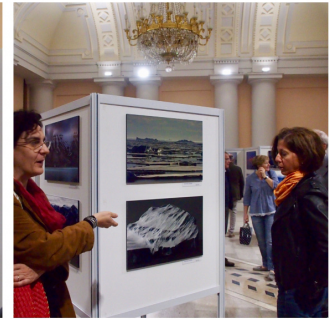
Figure 2. Working-age visitors and the photographs displayed during the exhibition.

ice sheets, helps to regulate the Earth's climate by reflecting most solar energy back to space, whereas the dark oceans and seas absorb most of the solar radiation, further contributing to Earth and climate warming.