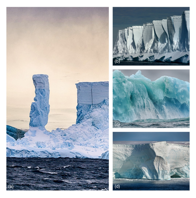
Figure 5. Icebergs and ice tongues in Antarctica. (a) Collapsed iceberg in the Ross Sea during the XXIX PNRA expedition under the ROSSLOPE II project. (b) Iceberg wall in the Ross Sea during the XXI PNRA Antarctic expedition under the WISE project. (c) Floating blue iceberg in the Ross Sea during the XXVIII PNRA expedition under the ROSSLOPE II project. (d) Drygalski glacier tongue in the Ross Sea during the XXXI PNRA expedition under the Holocene climatic fluctuations in sub-millennial recorded in sedimentary sequences expanded the Ross Sea (HOLOFERNE) project.

During 2019, for the first time, the Intergovernmental Panel on Climate Change (IPCC) released a report on the present impacts of climate change on the world's mountain environments. The surface air temperatures in the mountains of western North America, the European Alps, and high mountain Asia increased at an average rate of 0.3 °C per decade during the last 30 years, therefore outpacing the global warming rate (IPCC, 2019). The snow coverage duration, thickness, and extent decreased by an average of 5 d per decade, especially for those at lower elevations. From 2006 to 2015, the mass change in the glaciers in most of the mountain regions, excluding the polar areas (Canadian and Russian Arc-