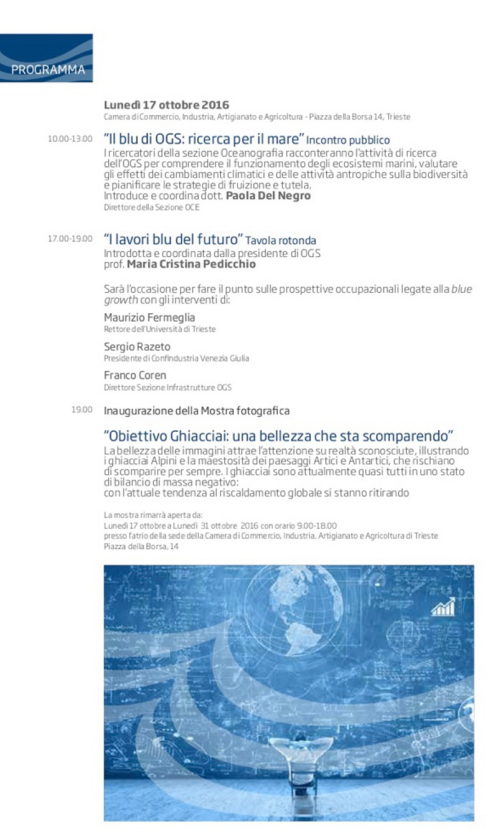
Figure 1. A sample of the flyer that reported some of the events organized by the OGS during the Settimana del Pianeta Terra (Planet Earth Week, https://www.settimanaterra.org, last access: 12 October 2016). The opening of our exhibition titled "Obiettivo Ghiacciai: una bellezza che sta scomparendo" took place on 17 October 2016.

to the receiver. The committee received 130 photographs, of which 26 images were chosen for the exhibition, corresponding to approximately 20% of the original photographic set. The photographs mainly illustrated the two polar regions and the Alps and other mountainous regions. The exhibition was freely accessible to the Chamber of Commerce's visitors and employers and, therefore, to working-age adults (18–64 years). At the exhibition opening, and on the occasion of other conferences related to the Earth Planet public event, the creators of the photographs were present and directly interacted with the public (Fig. 2).