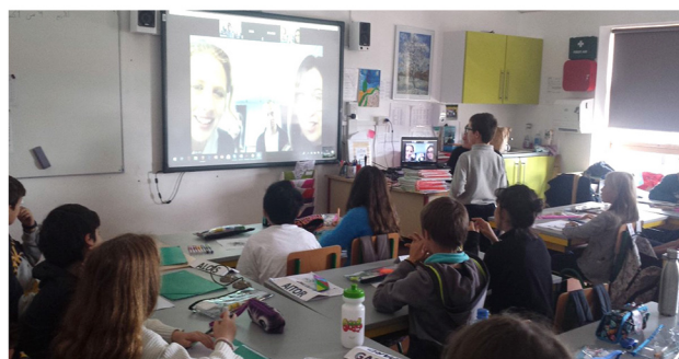
Lycée Français d'Irlande, Primary School, Dublin