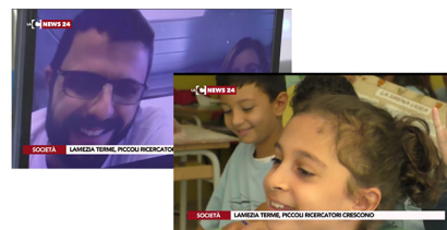
I.C. Don Milani Lamezia Terme, Italy